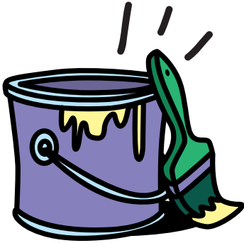
Raster object / 72ppi