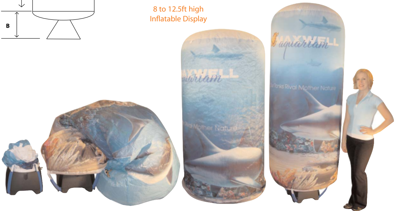
8 to 12.5ft high Inflatable Display

Need a little marketing muscle?...want to turn more heads and make a big splash in a crowd? The Genie is at your command!